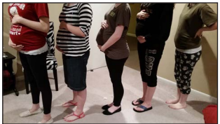
page 2 FAQ.