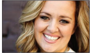
page 3 Banquet

10420 Heart of Hope Way Keithville, LA 71047 318.925.4663 www.heartofhopeministry.org